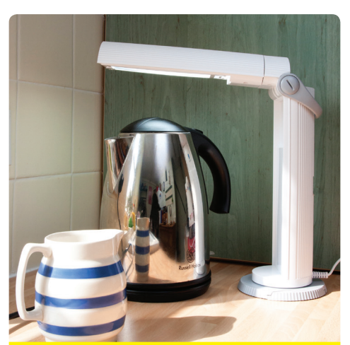
Use task lighting and contrasting colour in the kitchen.

In Touch is a BBC Radio 4 programme. It features items on many aspects of dealing with sight loss including benefits, new treatments and special events. Tune in every Tuesday at 8.40pm. Also available on iPlayer or as a podcast.