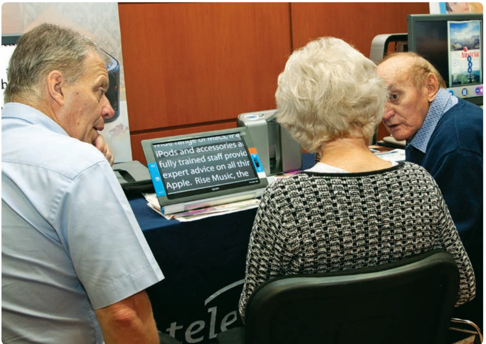
Trying out low vision aids at the Macular Society conference

Some retailers will arrange a demonstration