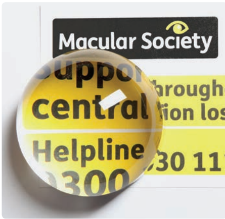
A flat-form magnifier

only available in lower levels of magnification but it is possible to combine them with other magnifiers.